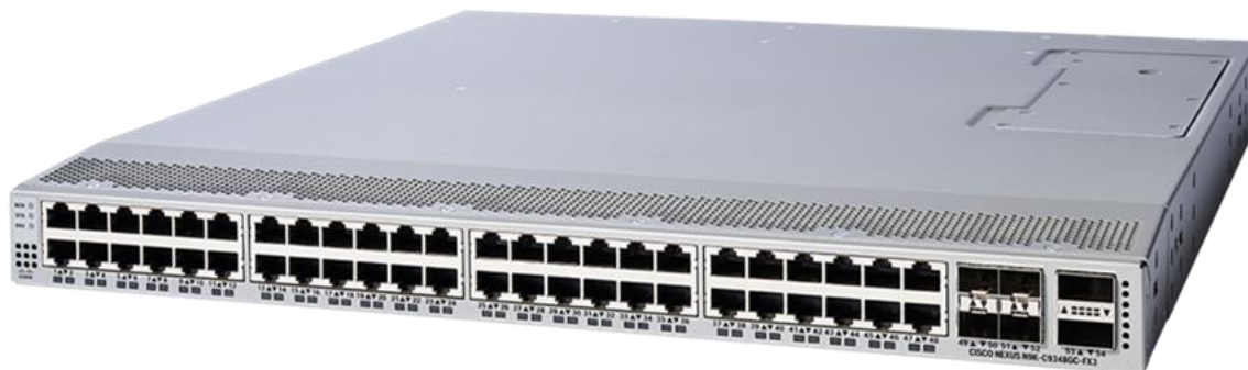
Figure 4. Cisco Nexus 9348GC-FX3 Switch

The Cisco Nexus 9348GC-FX3 Switch (Figure 4) is a 1RU switch that supports 696 Gbps of bandwidth and over 517 Mpps. The 48 1GBASE-T downlink ports on the 9348GC-FX3 can be configured to work as 10-Mbps, 100-Mbps, or 1-Gbps ports. The 4 ports of SFP28 can be configured as 1/10/25-Gbps and the 2 ports of QSFP28 can be configured as 40- and 100-Gbps ports, or a combination of 10-, 25-, 40, 50-, and 100-Gbps connectivity, offering flexible migration options.