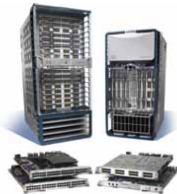
Figure 1. Cisco Nexus 7000 Switch Series

The Cisco® Nexus 7000 Series (Figure 1) is the first in a new generation of data center–class switches and expands the Cisco portfolio of data center switching solutions. As the network platform for Cisco Data Center 3.0, the Cisco Nexus 7000 Series delivers new levels of operational continuity, transport flexibility, and infrastructure scalability to meet the demands of the next-generation data center. The Cisco Nexus 7000 Series also positions customers to effectively address emerging data center trends such as resource virtualization, faster transport (40 Gigabit Ethernet and 100 Gigabit Ethernet), and unified fabric with a hardware and software architecture designed for investment protection.