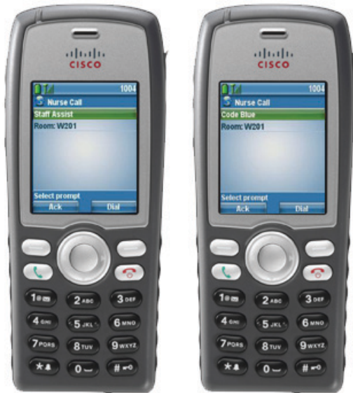
Figure 2. Nurse Call Alert

Integration with the Cisco Unified Application Environment platform offers a unique level of investment protection due to easier revision-level changes on Cisco Unified Communications systems, the elimination of a potential point of failure, and a significant cost reduction. The simple integration with nurse call systems can also serve as the entry point for voice-over-wireless LAN implementations.