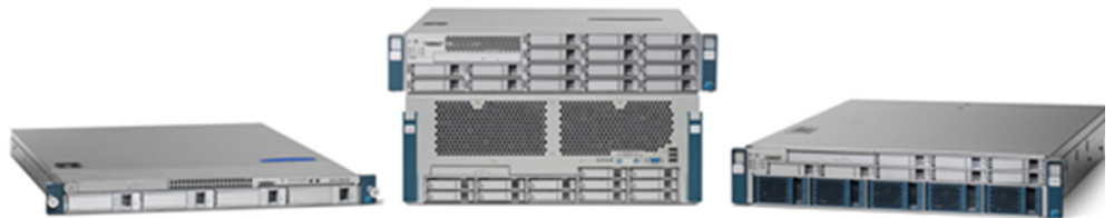
Figure 2: The Cisco UCS Product Family

The Cisco UCS C-Series Rack Mount Servers feature Intel Xeon 5500 series processors and PCI Express Gen 2 bus that deliver intelligent performance, automated energy efficiency, and flexible virtualization. Intel Turbo Boost Technology automatically boosts processing power through increased frequency and use of hyperthreading to deliver high performance when workloads demand and thermal conditions permit. The patented Cisco Extended Memory Technology offers twice the memory footprint (384 GB) of any other server using 8-GB DIMMs, or the economical option of a 192-GB memory footprint using inexpensive 4-GB DIMMs. Both choices for large memory footprints can help speed performance of data intensive applications by allowing more data to be cached in memory.