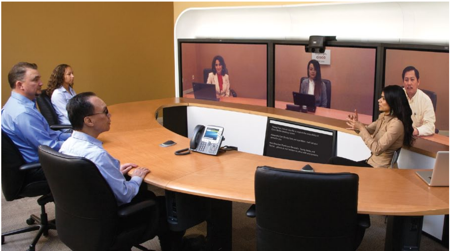
The Cisco TelePresence® portfolio creates an immersive, face-to-face experience over the network.