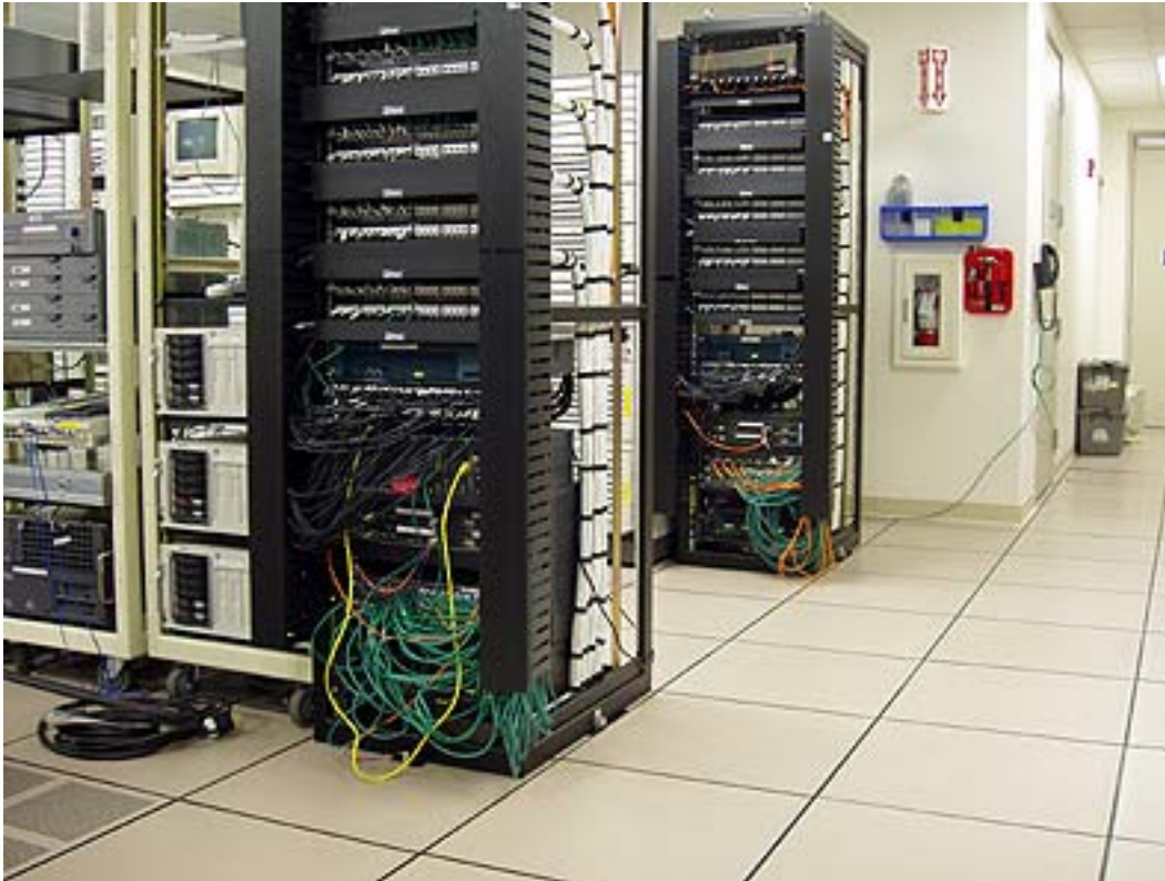
Figure 5. Network Rack at End of Half-Rows

Ian: "You won't see this same architecture or standardization in this business data center, however. In this data center, instead of a network rack at the end of each half-row, we use the production network standard: A single rack of network equipment at the end of the data center. There are two reasons for that: First, our production data centers are a bit older and their design predated the standardization effort here in Cisco. Also, business systems tend to go in and stay in for a long period of time, so you can afford a higher level of defense and a higher level of effort to put them in place because you're not going to have to change them several times over three years. If we ever redo the production data centers or build a new one, we would build it like this, with these zonal cabinets.