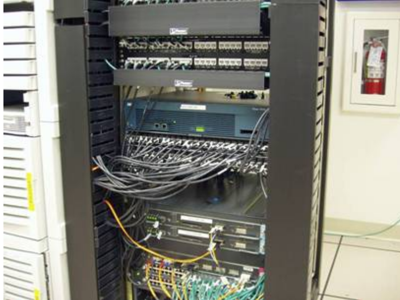
Figure 3. Console Network Routers

Dick: “Along with the data center network, we also support a separate console network here. In some data areas they have direct console connectivity, a monitor, and keyboard in various sections to allow people to log directly in to hosts or switches.