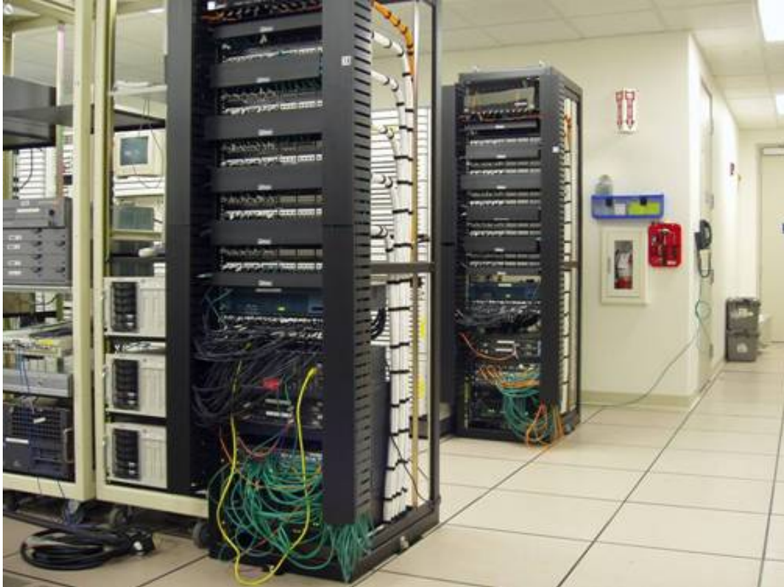
Figure 2. Cisco Catalyst 6500 Series Switch and Cisco 3600 Series Multiservice Platform in Network Cabinet in a Half-Row

Ian: “We use Cisco 6500 Series switches everywhere, in every one of the business data centers, and every one of the engineering data centers, and in fact in all the data facilities whether they are on a desktop or in a data center. By standardizing on a single platform we make the infrastructure more stable, and far more predictable and easier to maintain.