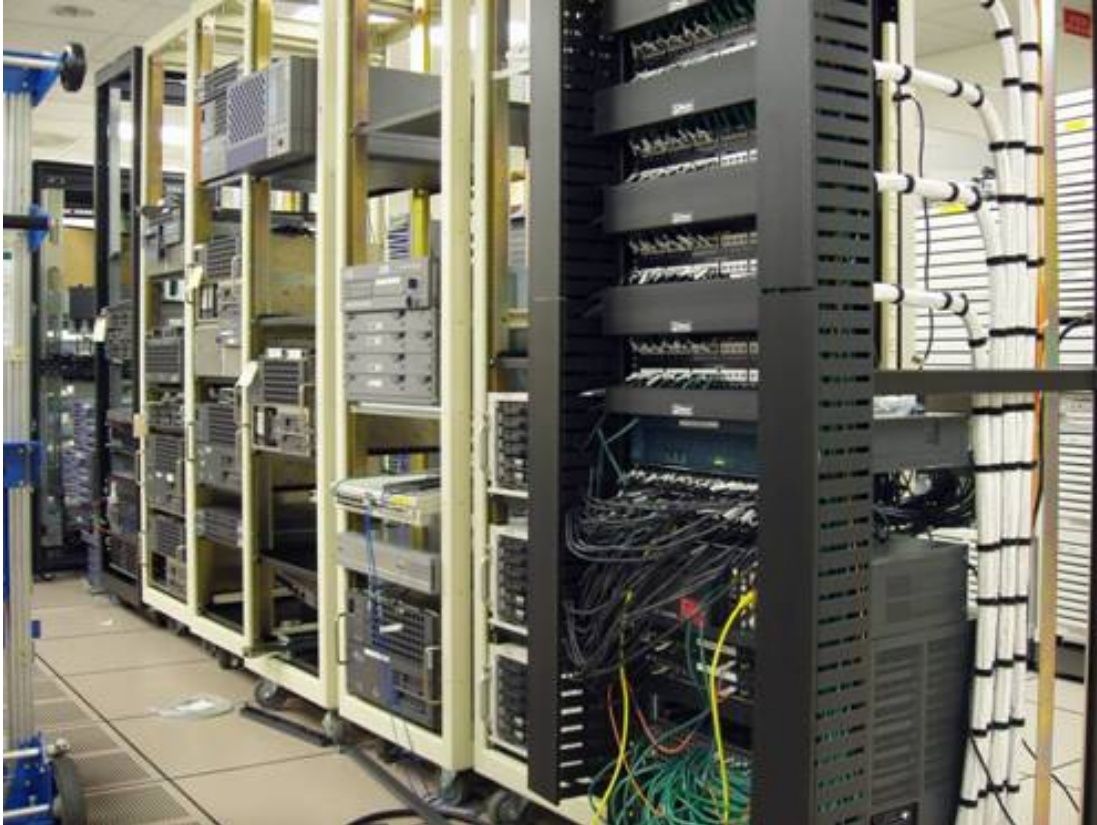
Figure 1. Inside the Build Room

Ian: “The purpose of the Build room is for the system vendors to rack, stack, and configure new systems before they go into production, to try new equipment and new configurations and burn in new equipment without affecting our production environment or setting off alarms. I should be able to turn off the power to this Build room and we should see no alarms at all.