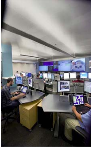
Figure 2. The Cisco SFOC manages incidents 24 hours a day using Cisco IPICS

Cisco ERT conduct drills with agencies, such as the San Jose and Milpitas Fire and Police Departments, the Santa Clara County Emergency Medical Services (EMS) Agency, the Bureau of Alcohol Tobacco and Firearms (ATF), and the Stanford Hospital Air Ambulance.