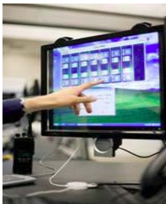
Figure 1. All emergency calls at Cisco are dispatched through the IPICS PMC

Cisco SAS is primarily responsible for managing emergencies that occur on company property. That responsibility begins when a Cisco employee or visitor dials 9-1-1 from any Cisco IP phone on campus. The call is routed to the nearest Cisco SFOC, which dispatches Cisco security officers and the Cisco ERT. If the incident requires a local public safety agency, the SFOC patches the call to the appropriate Public Safety Access Point (PSAP).