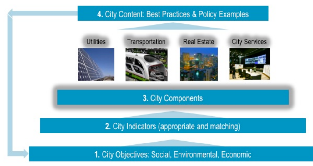
Figure 1. Smart City Framework Layers (from bottom to top).

City leaders define actions or initiatives by their impact on stated city objectives. This is why the proposed Smart City Framework (see Figure 1) starts with city objectives as its base, against which all initiatives are then measured.