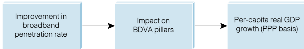
Figure 1. Flow of the BDVA Model