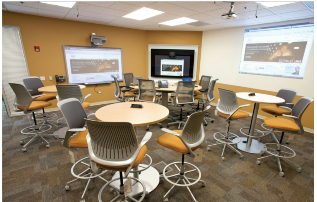
Figure 2. The Interactive Whiteboard, Projection Screen, and Team Members Can Be Seen by All Participants in the Meeting