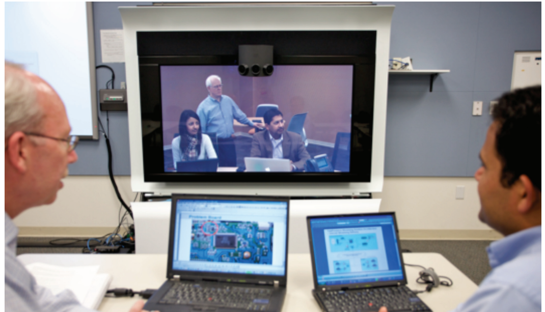
Figure 3. Visibility into the ACE Room Enables High Productivity for Remote Participants

“Demand for ACE [within the organization] is really accelerating. Most folks just visit the room and immediately see the potential to positively impact both quality and speed.”