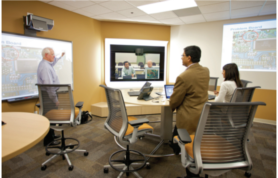
Figure 4. ACE Room Layout Allows Sharing of Large-Format Content

task groups. People feel comfortable in the ACE space, and are interacting in a way the company has not seen before.