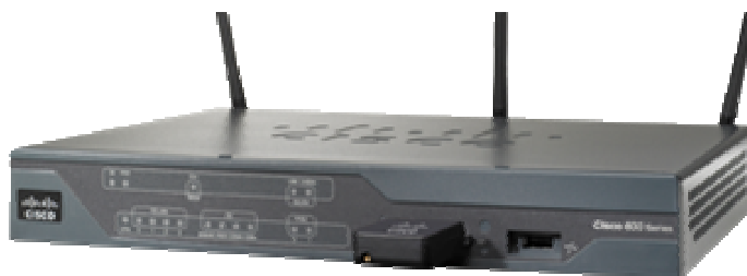
Figure 1. Cisco 880G Series 3G Wireless Integrated Services Routers

With enhanced data rates and improved latency (below 100 milliseconds), WWAN services are an ideal way to supplement traditional wireline services. Third-generation WWAN data services offered today have average data rates well in excess of ISDN speeds, with theoretical limits in excess of 7 Mbps on the downlink and 2 Mbps on the uplink. Cisco is building on these performance milestones and adding support for wireless broadband to our wide variety of access routers.