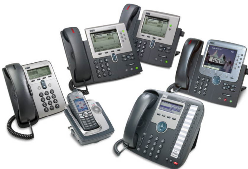
Figure 3. Cisco Unified IP Phone Portfolio