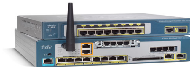
Figure 1. Cisco Unified Communications 500 Series—8/16 User Configuration

Cisco Unified Communications 500 Series for Small Business, a critical part of the Cisco Smart Business Communications System, is a unified communications appliance for small businesses that provides voice, data, voicemail, Automated Attendant, video, security, and wireless capabilities while integrating with existing desktop applications such as calendar, e-mail, and customer relationship management (CRM) programs. This easy-to-manage platform uses business-class, proven unified communications technologies to support up to 50 users, and supports flexible deployment models based on your needs—a wide array of IP phones, public switched telephone network (PSTN) interfaces, and Internet connectivity (Figure 1).