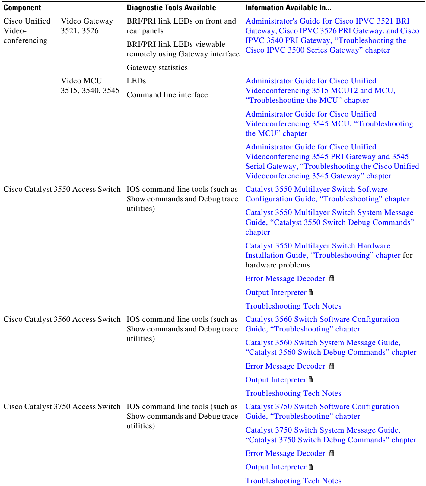
Table 4-2 IP Telephony Component Troubleshooting Tools and Documentation