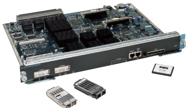
Figure 1 Cisco Catalyst 4000 Family Supervisor Engine IV

The Cisco Catalyst Supervisor Engine IV delivers next-generation switching technology with proven Cisco IOS ® Software to power scalable, intelligent multilayer switching solutions for converged data, voice, and video networks. Optimized for the enterprise wiring closet, branch-office backbones, or Layer 3 distribution points, the Cisco Catalyst Supervisor Engine IV provides the performance and scalability to handle today's and tomorrow's network applications. Compatible with the widely deployed Cisco Catalyst 4006 chassis, the new Cisco Catalyst 4500 Series chassis, and existing Cisco Catalyst 4000 Series line cards, the Catalyst 4000 Family Supervisor Engine IV ensures an extended window of deployment to further strengthen the scalability of the modular Cisco Catalyst 4000 Family.