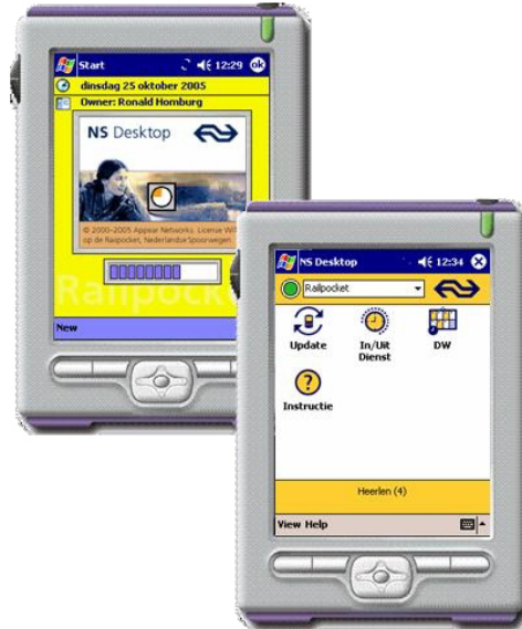
Figure 2 Netherlands Railways PDA

Using a set of predetermined filters – including job responsibilities, physical location, time-of-day, and device type – Appear IQ, a “context aware” middleware from Appear Networks, identifies the mission-critical data and available applications that have value and relevance to each mobile employee and pushes them to the user’s handheld device. Railways customer service representatives, train conductors, platform staff, and operations teams have access to application services, regardless of where they are located. This rapid adaptation of resources improves employee efficiency, responsiveness, and overall productivity.