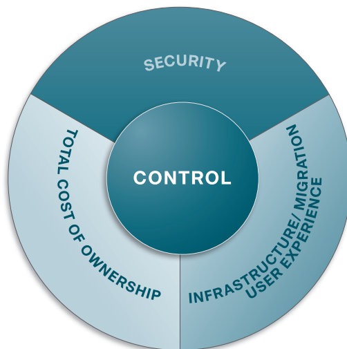
Figure 1. Cisco and VMware Deliver a Comprehensive, Centralized Virtual Desktop Solution That Gives Companies Superior Control Over Security, Infrastructure, Migration, and Total Cost of Ownership While Maintaining an Outstanding User Experience

The need to regain control over data and to rein in the ever-increasing cost of maintaining a personal computer for each employee has made desktop virtualization a top priority in many companies. Cisco® Desktop Virtualization Solution with VMware View centralizes the components of the desktop in the data center to enable exceptional control of applications and data while improving IT's capability to manage and deliver desktops. This solution helps reduce IT costs and enables flexible access and an improved experience for end-users (Figure 1). The Cisco Desktop Virtualization Solution with VMware View is delivered as part of Cisco's Virtual Experience Infrastructure (VXI), providing an open end-to-end service-optimized infrastructure for workplace virtualization.