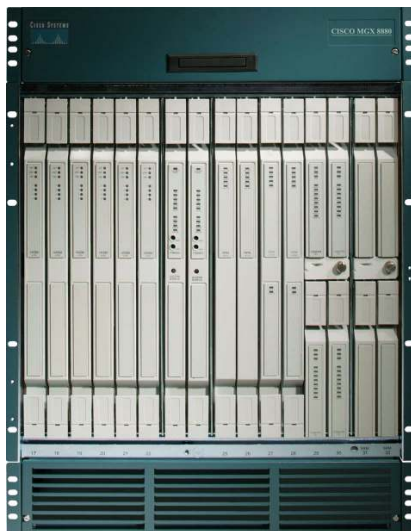
Figure 1. Cisco MGX 8880 Media Gateway

With its superior density, scalability, and performance, the Cisco MGX 8880 Media Gateway (Figure 1) helps service providers to deploy a comprehensive set of voice over IP (VoIP) applications that help lower operational expenses and generate new services revenue.