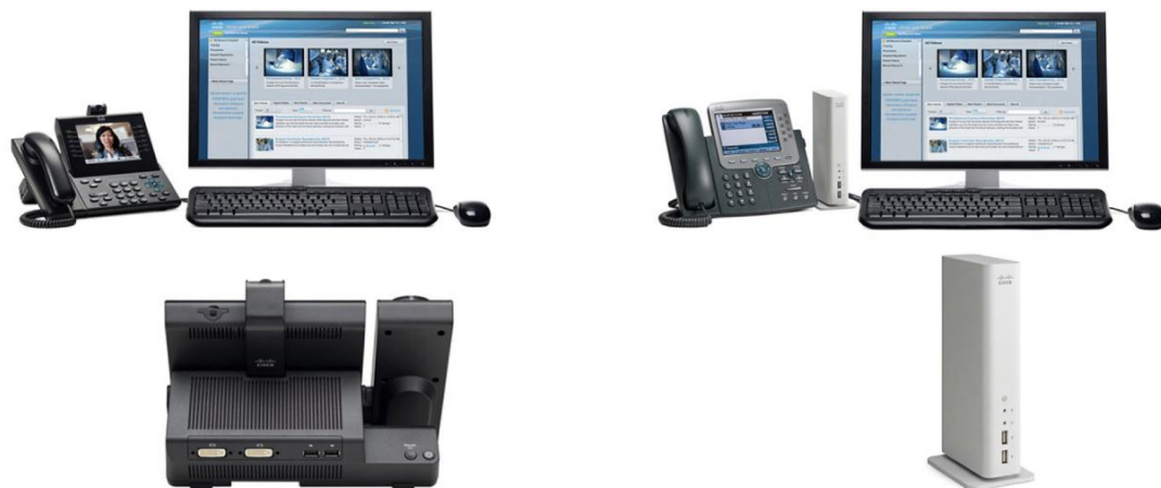
Cisco VXC 2111 with Cisco Unified IP Phone 9971