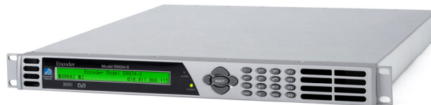
Figure 1. Cisco D9034-S Encoder

The extensive features allow the D9034-S Encoder to address a wide range of applications such as contribution, cable headends, DTH play-outs, and IP headends.