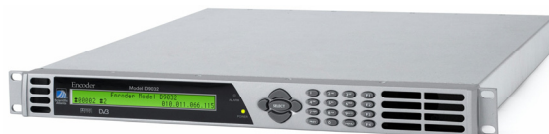
Figure 1. Cisco D9032 Encoder

The extensive features allow the D9032 Encoder to address a wide range of applications such as contribution, cable headends, DTH or DVB-T play-outs and IP headends.