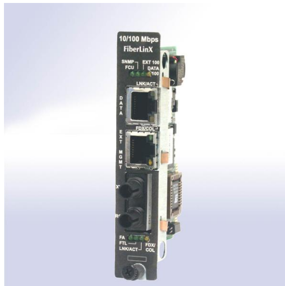
Figure 1. Prisma FiberLinX-II Optical Media Converter Module

Prisma FiberLinX modules allow for remote configuration, and alert administrators to any potential problems on the long-haul fiber run. These modules also provide vital information on link condition and report data traffic statistics. Additionally, these modules help reduce the total cost of network equipment by functioning as a copper-to-fiber media converter, allowing the use of lower-cost copper switches at both ends of the fiber connection.