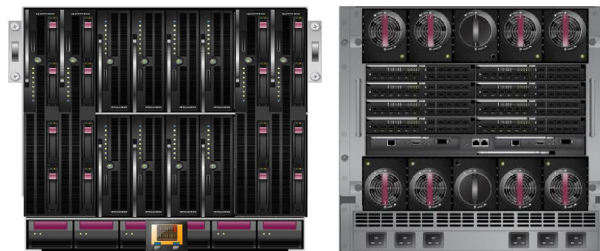
Figure 1: Front and Back Views of HP c-Class BladeSystem Enclosure

The HP c-Class BladeSystem backplane provides power and network connectivity to the blades. The base I/O module slots house a pair of Cisco Catalyst Blade Switches for HP, which provide a highly available and multihomed environment wherein each server blade is attached through a Gigabit Ethernet port to each Cisco Catalyst Blade Switch for HP. Two Cisco Catalyst Blade Switches within the blade enclosure connect the blade server modules to external network devices such as aggregation-layer switches.