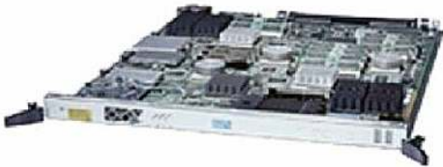
Figure 2. Cisco 12000 Series 16-, 8-, and 4-Port OC-3c/STM-1c POS ISE Line Cards