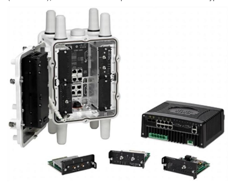
Figure 1. Cisco 1000 Series connected grid routers

The Cisco CGR 1000 Series includes two platforms, shown in Figure 1: The Cisco 1120 Connected Grid Router (CGR 1120), which is designed for indoor deployments; and the Cisco 1240 Connected Grid Router (CGR 1240), which is a weatherproof router in a NEMA Type 4 enclosure for outdoor deployments.