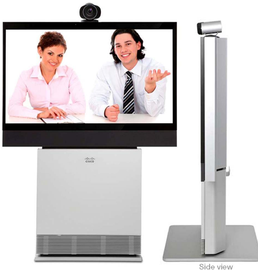
Figure 1. Cisco TelePresence System Profile 42-inch for Immediate Team Collaboration

The Cisco TelePresence® portfolio creates a face-to-face experience - empowering you to collaborate with others like never before. Through a powerful combination of technologies and design that allows you and remote participants to feel as if you are all in the same room, the Cisco TelePresence portfolio has the potential to provide great productivity benefits and transform your business. Many organizations are already using it to control costs, make decisions faster, improve customer intimacy, scale scarce resources, and speed products to market.