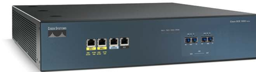
Figure 1. Cisco SCE 1010

The Cisco® SCE 1000 Series Service Control Engine is a network element specifically designed for carrier-grade deployments requiring high-capacity stateful application and session-based classification and control of application-level IP traffic per subscriber.