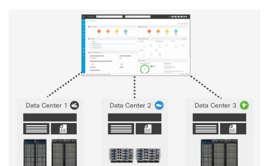
Figure 1. Global Management Across Domains, Systems, and Locations

Cisco UCS Central Software extends the capabilities and concepts of Cisco UCS Manager to enable the streamlined management of up to 10,000 servers across hundreds of sites from a single, intuitive HTML5 user interface. It dramatically simplifies operations, automates routine tasks, enhances consistency, and reduces risk for environments with multiple Cisco UCS domains. It is an easy-to-install, secure virtual appliance. Once you deploy it, you can manage servers in multiple data centers and remote locations as easily as you can manage a single Cisco UCS domain. The software addresses the need to deploy workloads and infrastructure and enforce policy compliance across disparate locations. Cisco UCS Central Software uses Cisco UCS service profiles to implement automated, role and policy-based management on a global scale (Figure 1).