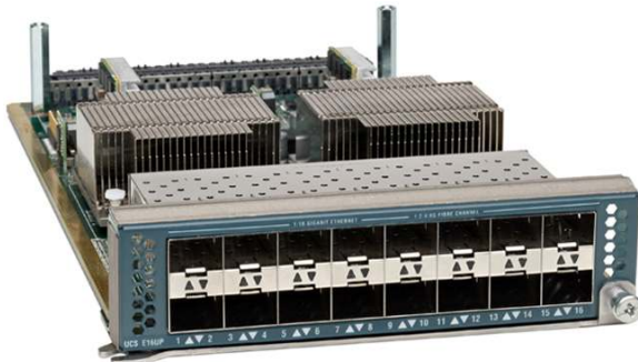
Figure 5. Unified Port 16-Port Expansion Module

The Cisco UCS 6200 Series supports an expansion module that can be used to increase the number of 10 Gigabit Ethernet, FCoE and FC ports (Figure 5). This unified port module provides up to 16 ports that can be configured for 10 Gigabit Ethernet, FCoE and/or 1/2/4/8-Gbps native Fibre Channel using the SFP or SFP+ 3 interface for transparent connectivity with existing Fibre Channel networks.