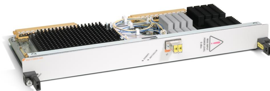
Figure 1. Cisco 1-Port 10GE Tunable WDM-PHY Interface SPA

The 10GE Tunable WDM-PHY SPA is part of the Cisco IP-over-DWDM solution portfolio. Service providers benefit from IP-over-DWDM integration through faster service provisioning, increased reliability, and simplified network management. Integrated DWDM transponders simplify the network by reducing the number of network elements and also scale at a lower total cost to reduce bandwidth cost. Finally, IP-over-DWDM solutions allow service providers to more cost-effectively use the rich QoS and IP intelligence of Cisco routers in their transport networks.