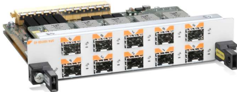
Figure 1. Cisco 10-Port Gigabit Ethernet SPA

The Cisco® Interface Flexibility (I-Flex) design combines shared port adapters (SPAs) and SPA interface processors (SIPs), taking advantage of an extensible design that helps enable service prioritization for voice, video, and data services. Enterprise and service provider customers can take advantage of improved slot economics resulting from modular port adapters that are interchangeable across Cisco routing platforms. The Cisco I-Flex design maximizes connectivity options and offers superior service intelligence through programmable interface processors that deliver line-rate performance. Cisco I-Flex enhances speed-to-service revenue and provides a rich set of quality of service (QoS) features for premium service delivery while effectively reducing the overall cost of ownership. This data sheet contains the specifications for the Cisco 2-, 5-, 8-, and 10-Port Gigabit Ethernet Shared Port Adapters, Version 2 (Figures 1, 2, and 3).