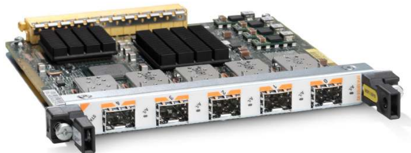
Figure 2. Cisco 5-Port Gigabit Ethernet SPA

The Cisco 2-, 5-, 8-, and 10-Port Gigabit Ethernet SPAs are available on high-end Cisco routing platforms, offering the benefits of network scalability with lower initial costs and ease of upgrades. The Cisco SPA/SIP portfolio continues the company's focus on investment protection along with consistent feature support, broad interface availability, and the latest technology. The Cisco SPA/SIP portfolio allows deployment of different interfaces (Packet over SONET/SDH [PoS], ATM, Ethernet, etc.) on the same interface processor.