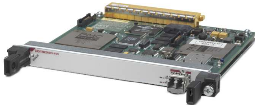
Figure 1. Cisco 1-Port Channelized STM-1/OC-3 SPA

The Cisco® I-Flex approach combines shared port adapters (SPAs) and SPA interface processors (SIPs), providing an extensible design that enables service prioritization for data, voice, and video services. Enterprise and service provider customers can take advantage of improved slot economics resulting from modular port adapters that are interchangeable across Cisco routing platforms. The Cisco I-Flex design maximizes connectivity options and offers superior service intelligence through programmable interface processors that deliver line-rate performance. Cisco I-Flex enhances speed-to-service revenue and provides a rich set of quality-of-service (QoS) features for premium service delivery while effectively reducing the overall cost of ownership. This data sheet contains the specifications for the Cisco 1-Port Channelized STM-1/OC3 SPA as shown in Figure 1.