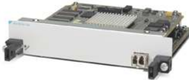
Figure 1. Cisco 1-Port OC-48c ATM SPA

The Cisco® Interface Flexibility (I-Flex) design combines shared port adapters (SPAs) and SPA interface processors (SIPs), taking advantage of an extensible design that helps enable service prioritization for voice, video, and data services. Enterprise and service provider customers can take advantage of improved slot economics resulting from modular port adapters that are interchangeable across Cisco Systems® routing platforms. The Cisco I-Flex design maximizes connectivity options and offers superior service intelligence through programmable interface processors that deliver line-rate performance. Cisco I-Flex enhances speed-to-service revenue and provides a rich set of quality-of-service (QoS) features for premium service delivery while effectively reducing the overall cost of ownership. This data sheet contains the specifications for the Cisco 1-Port OC-48c/STM-16 ATM Shared Port Adapter (1-Port OC-48c ATM SPA; refer to Figure 1).