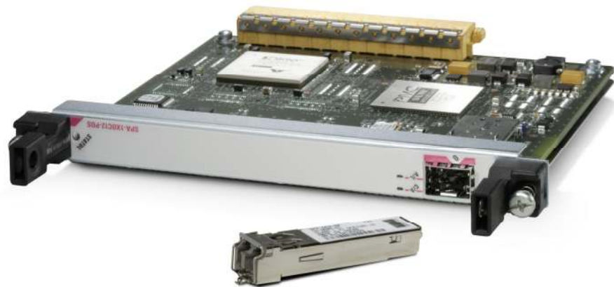
Figure 1. Cisco 1-Port OC-12 POS SPA with SFP Optics

The Cisco® I-Flex approach combines shared port adapters (SPAs) and SPA interface processors (SIPs), providing an extensible design that enables service prioritization for data, voice, and video services. Enterprise and service provider customers can take advantage of improved slot economics resulting from modular port adapters that are interchangeable across Cisco routing platforms. The I-Flex design maximizes connectivity options and offers superior service intelligence through programmable interface processors that deliver line-rate performance. I-Flex enhances speed-to-service revenue and provides a rich set of quality of service (QoS) features for premium service delivery while effectively reducing the overall cost of ownership. This data sheet contains the specifications for the Cisco 1-Port OC-12c/STM-4c POS Shared Port Adapter (Cisco 1-Port OC-12 POS SPA; refer to Figure 1).