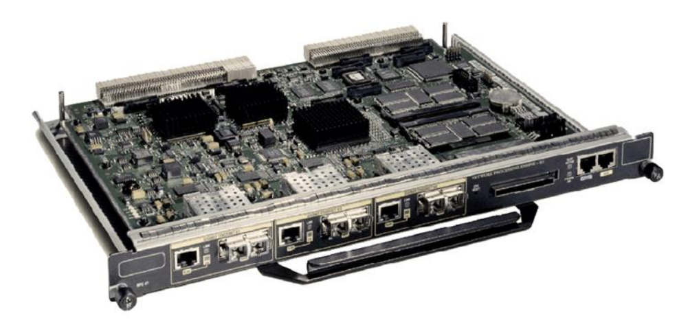
Figure 1. Cisco 7200 Series NPE-G1