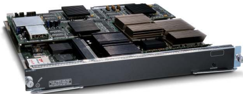
Figure 1. Cisco Catalyst 6500 Series and 7600 Series Firewall Services Module

The Cisco® Firewall Services Module (FWSM) for Cisco Catalyst® 6500 Series switches and Cisco 7600 Series routers is a high-performance, integrated stateful inspection firewall with application and protocol inspection engines. It provides up to 5.5 Gbps of throughput, 100,000 new connections per second, one million concurrent connections or 256,000 NAT translations and up to 80,000 Access Control Lists. Up to four FWSMs can be installed in a single chassis, providing scalability up to 20 Gbps per chassis. As an extension to the Cisco PIX®/ASA family of security appliances, the FWSM provides large enterprises and service providers with superior security, performance, and reliability.