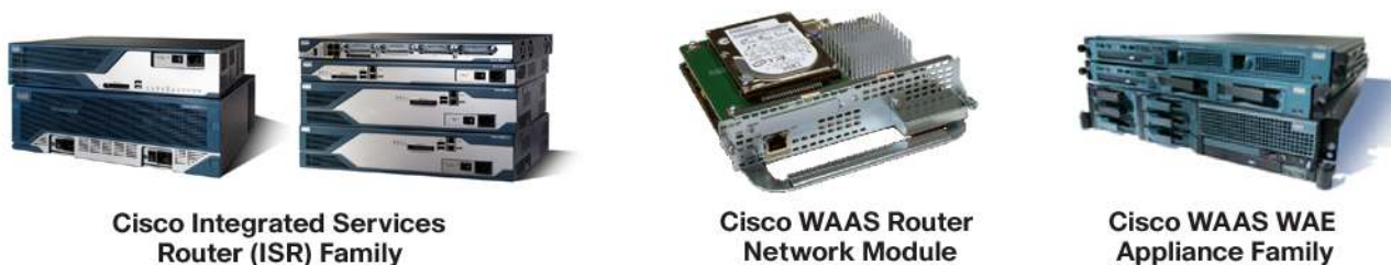
Figure 1. Cisco WAE and ISR Network Module

Cisco WAAS provides end-to-end application delivery that is network aware and network integrated. By maintaining network transparency and coherency with existing network features, all layers of the network remain preserved, as shown in figure 2.