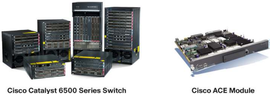
Figure 3. Cisco ACE Module and Cisco Catalyst 6500 Series Switches

Cisco WAAS integrates transparently with the Cisco ACE line card to provide a highly scalable and robust solution for end-to-end application delivery. Unlike other solutions that require cumbersome inline deployment in the data center, Cisco ACE and Cisco WAAS integrate transparently and intelligently to allow IT organizations to integrate end-to-end application delivery technologies in a nondisruptive fashion. By combining the two, enterprise organizations gain the following benefits: