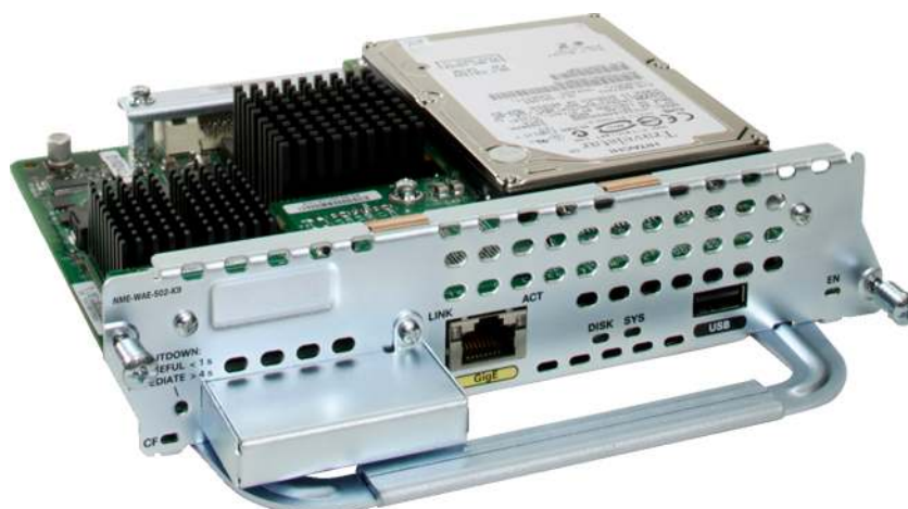
Table 2 gives specifications of the Cisco ACNS Network Module.