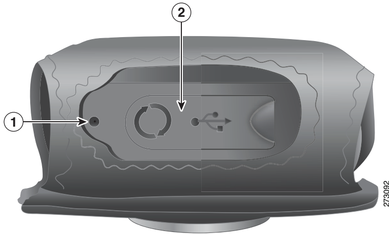
Figure 6 Leather Case Opening for Microphone and Mini-USB Port