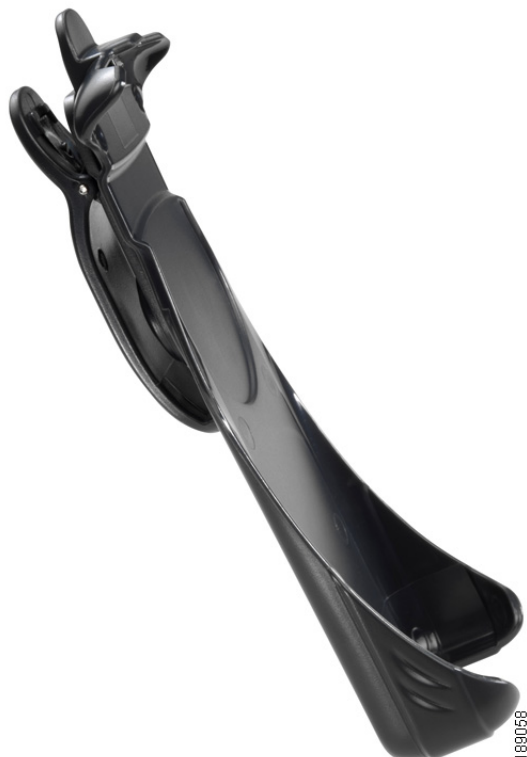
Figure 4 Holster Carry Case