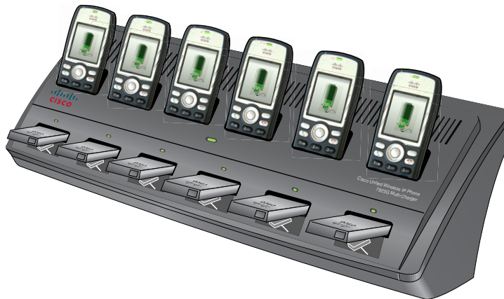
Figure 2 Cisco Unified Wireless IP Phone 7925G and 7925G-EX Multi-Charger

For more information, see the Cisco Unified Wireless IP Phone 7925G and 7925G-EX Multi-Charger Installation Guide .