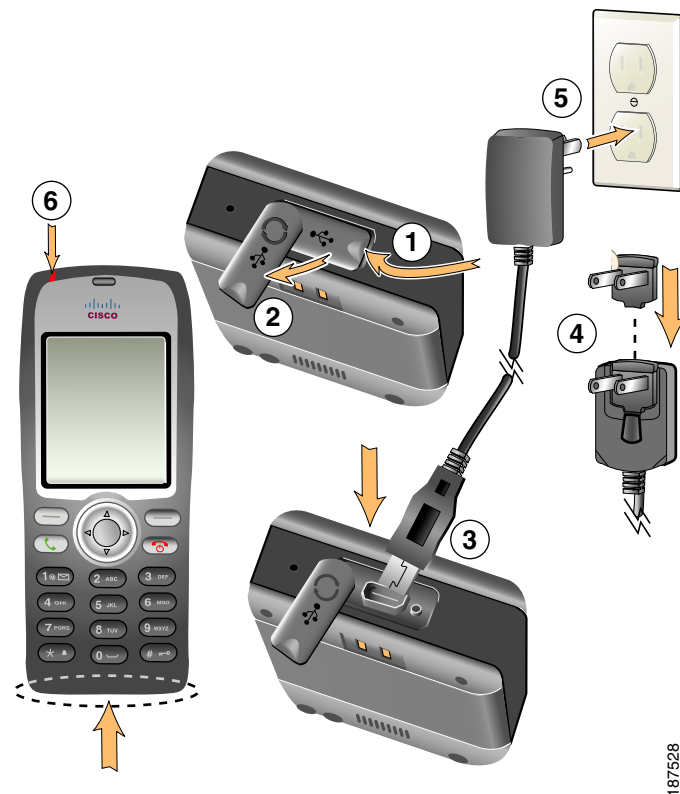
Figure 1 AC Power Supply