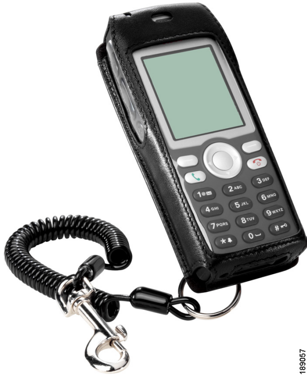
Figure 5 Leather Carry Case with Phone