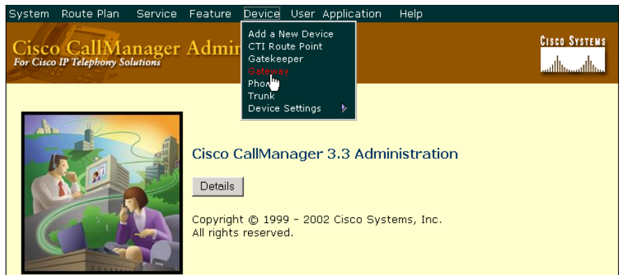
Figure 6-2 Cisco CallManager Administration Device Menu

The Find and List Gateways window displays.