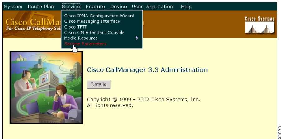
Figure 6-1 Cisco CallManager Administration Service Menu