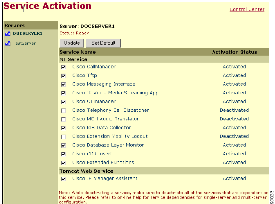
Figure 2-2 Service Activation Window

If the Activated status displays, the Cisco CallManager is active on the chosen server.