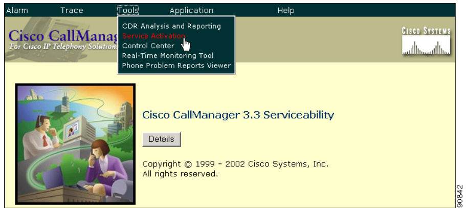
Figure 2-1 Cisco CallManager Serviceability Window Tools Menu

Step 3 From the Servers column, choose the server.