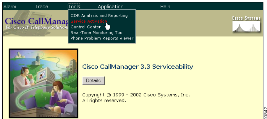
Figure 2-1 Cisco CallManager Serviceability Window Tools Menu