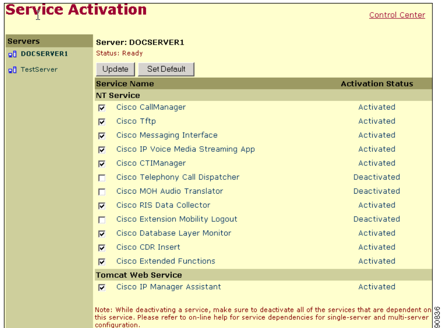
Figure 2-2 Service Activation Window

If Activated, the Cisco CallManager is active on the chosen server.