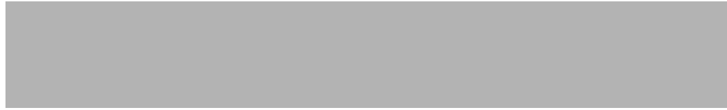
Figure 2-10 Aligning a CompactFlash Card to its Reader

Step 2 Push the card all the way into the reader.