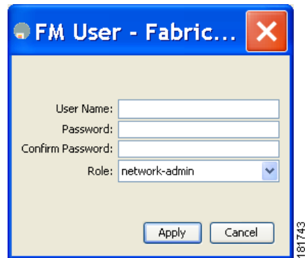
Figure 3-2 FM User Dialog Box

Step 3 Set the user name and password for the new user and then click Apply .