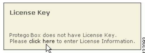
Figure 5-2 Click the License Key Link

If the MARS license key is not configured, the License Key dialog prompts you to enter this key.