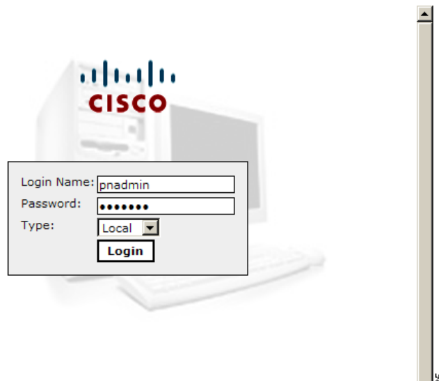
Figure 5-1 MARS Login Page

You will be prompted to install the Adobe SVG control if not previously installed.