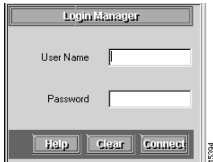
Figure 2-1 Login Manager Dialog Box