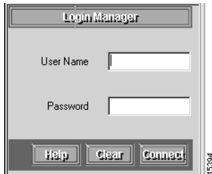
Figure 2-1 Login Manager Dialog Box

Step 2 Click Connect . The Login Manager dialog box is replaced by the navigation tree.