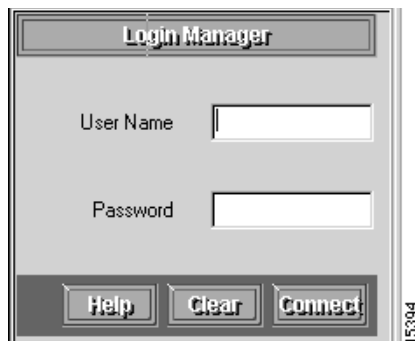
Figure 2-1 Login Manager Dialog Box