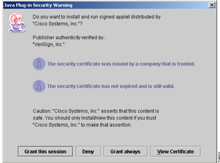
Figure 2 Java Plug-in Security Warning Window

After the MSFix2 installation begins, the WEBpatch Install Patch window appears. (See Figure 3.) Due to the long installation time of this patch, you will have to wait approximately 10 to 15 minutes for the entire installation to be completed and for the BBSM server to reboot.