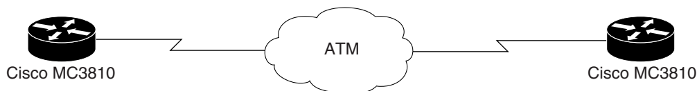
Figure 2 Sample Configuration: Two Cisco MC3810s using ATM SVCs for Voice

This example shows the configurations of two Cisco MC3810 multiservice access concentrators that each have voice dial peers connecting over ATM SVCs. For additional information, see the Cisco MC3810 Multiservice Access Concentrator Software Configuration Guide and the Cisco MC3810 Multiservice Access Concentrator Software Command Reference .