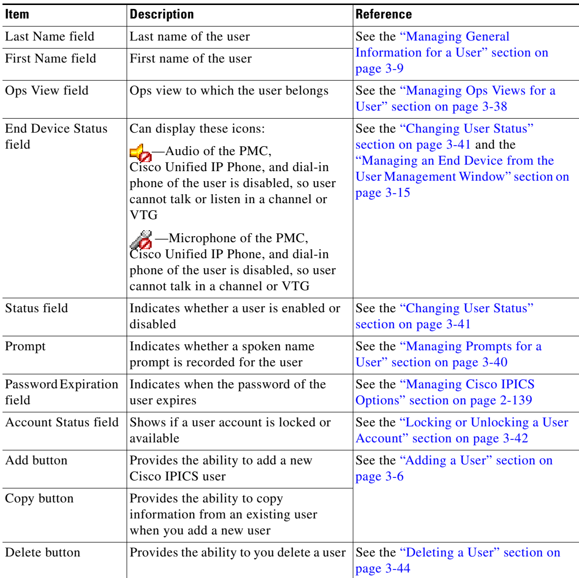
Table 3-1 Items in the Users Window (continued)